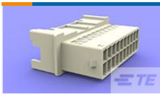
TE Part # 1969592-8 HSG,REC,FREE-HANGING,DUALROW,EP2.5