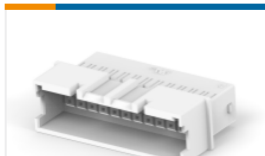
TE Part # 2-2324582-4 HSG,REC,FREE-HANGING,DUALROW,EP2.5